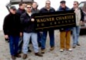
Past party boat workers united for one last look