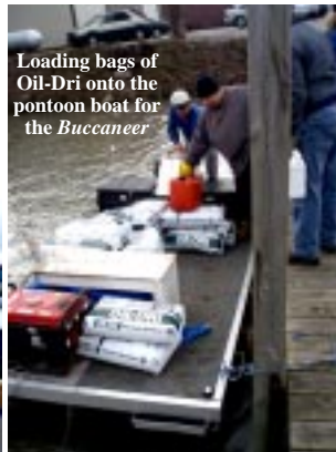
Loading bags of Oil-Dri onto the pontoon boat for the Buccaneer