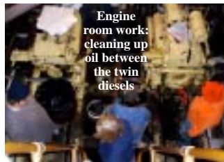
Engine room work: cleaning up oil between the twin diesels