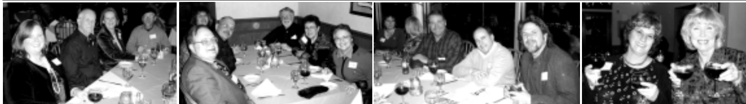
Largest Group in Years at the annual UASC/LOUP Christmas Party, Dec. 6, 2008!