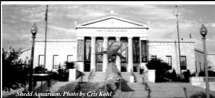
Shedd Aquarium.